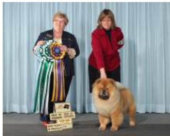
Winners Bitch, Best of Winners, Best of Opposite Sex, Best Puppy in Breed