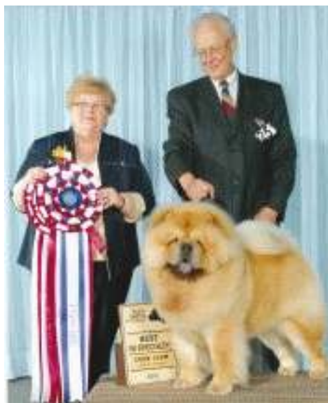
Best of Breed, Best Canadian Bred in Breed

Reserve Winners Altered Male - Ch. Chikoo's Murphy Law