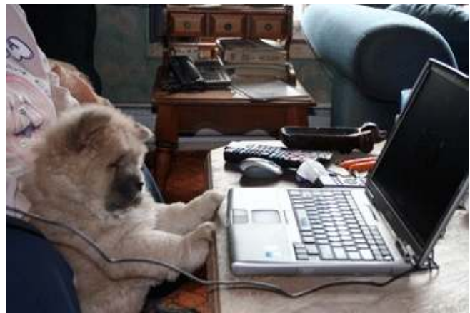
"Miko" 8 week old computer geek!

Theobromine is in all chocolate, especially dark or baker's chocolate which is toxic to dogs. Cocoa bean shells contain potentially toxic quantities of theobromine, a xanthine compound similar in effects to caffeine and theophylline. A dog that ingested a lethal quantity of garden mulch made from cacao bean shells developed severe convulsions and died 17 hours later. Analysis of the stomach contents and the ingested cacao bean shells revealed the presence of lethal amounts of theobromine.