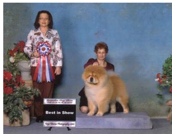
BIS at the Crocus Kennel Club Can. Am. Ch. Josol's Titan

If you use these dog exercise areas be alert, prevention is better than cure.